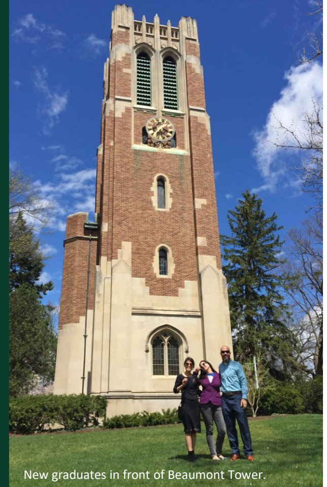
New graduates in front of Beaumont Tower.

Online since 2012 and now offering more options to inspire language educators.